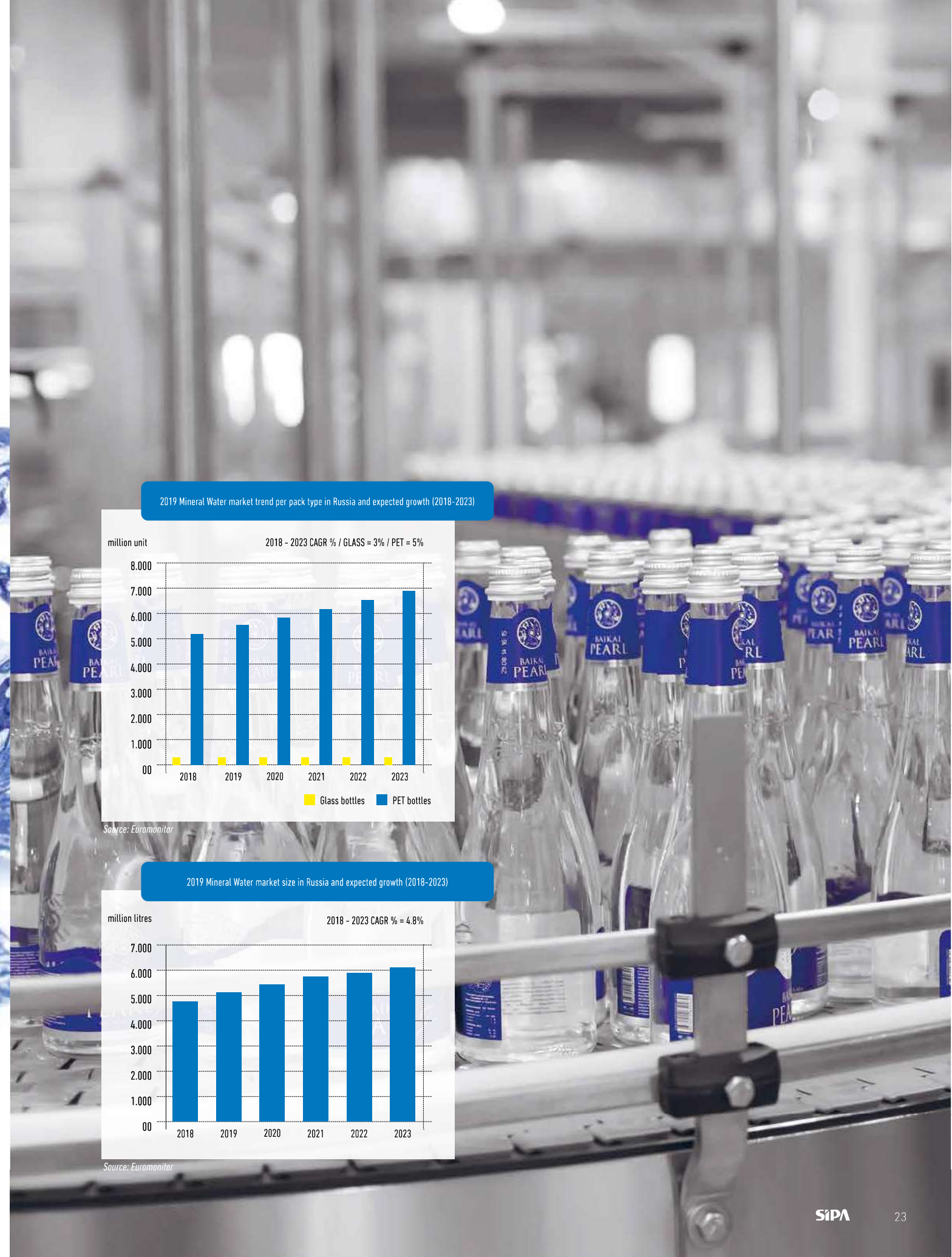
2019 Mineral Water market trend per pack type in Russia and expected growth (2018-2023)